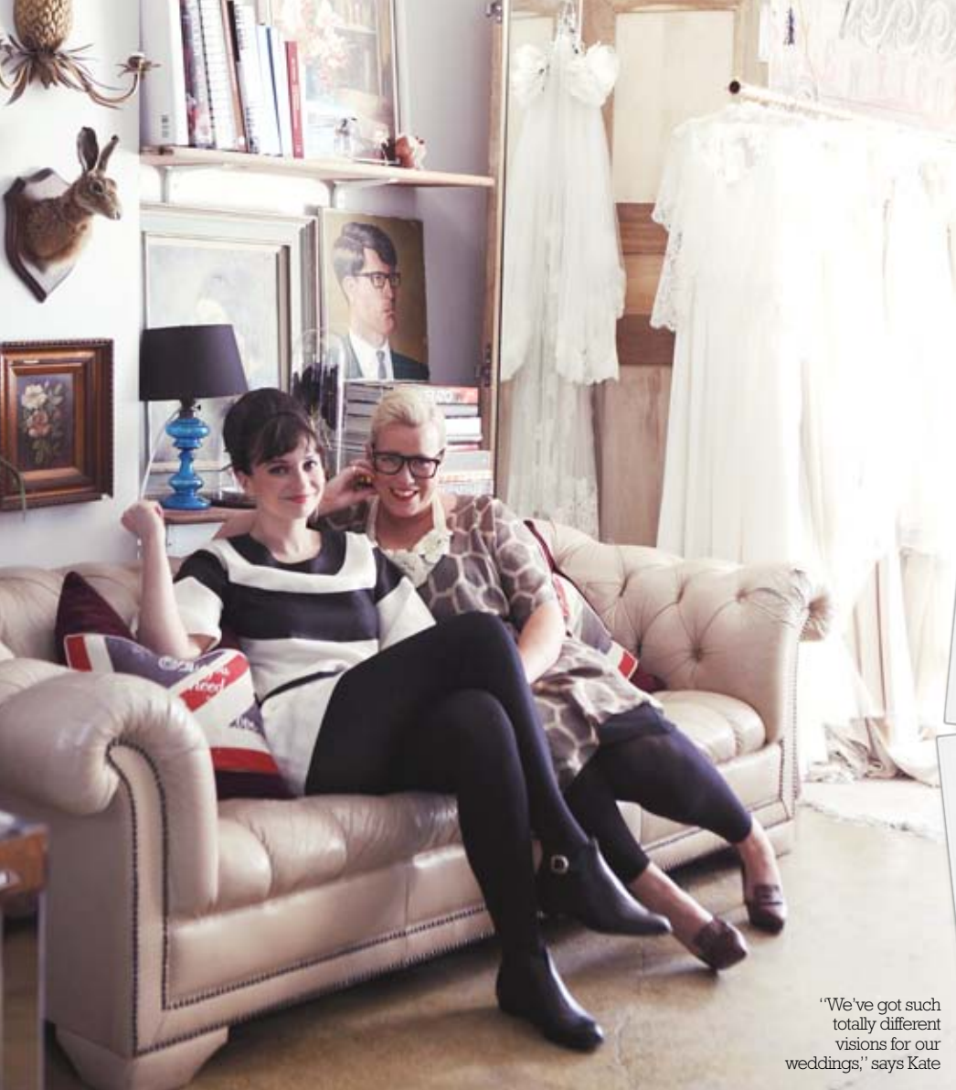
"We've got such totally different visions for our weddings," says Kate